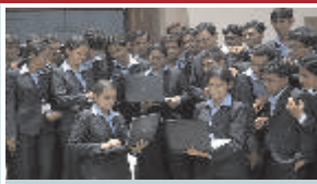
Wi-Fi Enabled Campus