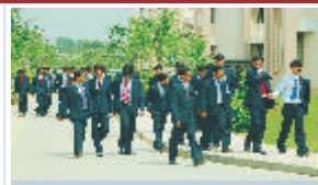
Lush Green Sylvan Campus