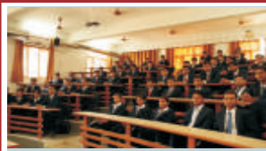
Air Conditioned MP Theater Class Room